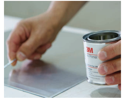
Quick dry time allows for immediate tape application.